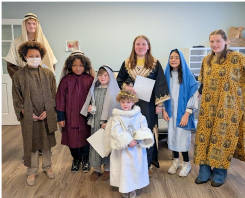
Christmas Pageant 2024