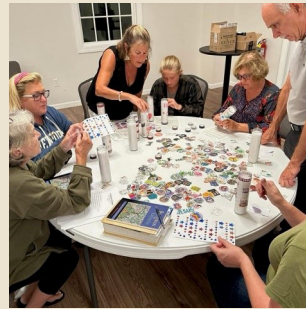
Election prayer candles