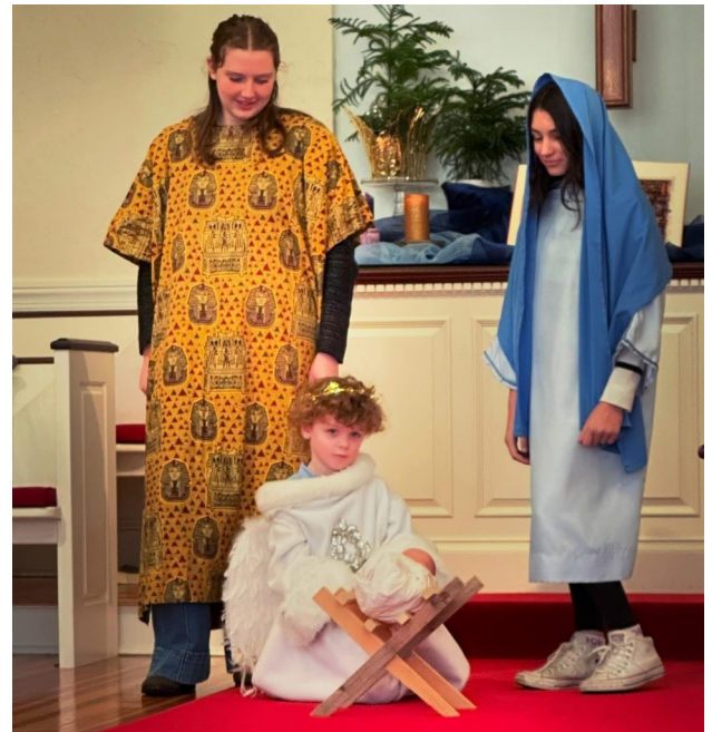
Christmas Pageant 2024