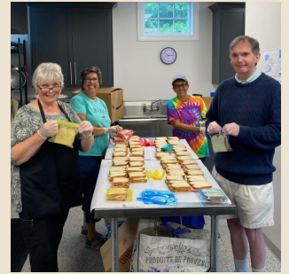
Miracle Kitchen prep