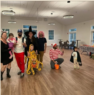
Halloween In Hall