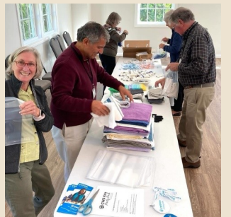
Hurricane relief kits