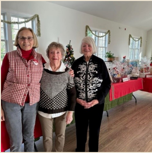
Christmas In Cotuit