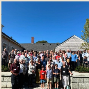
All church photo