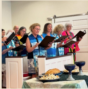
Larger space for choir