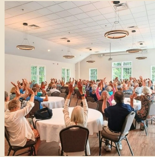
Hamilton Hall blessing