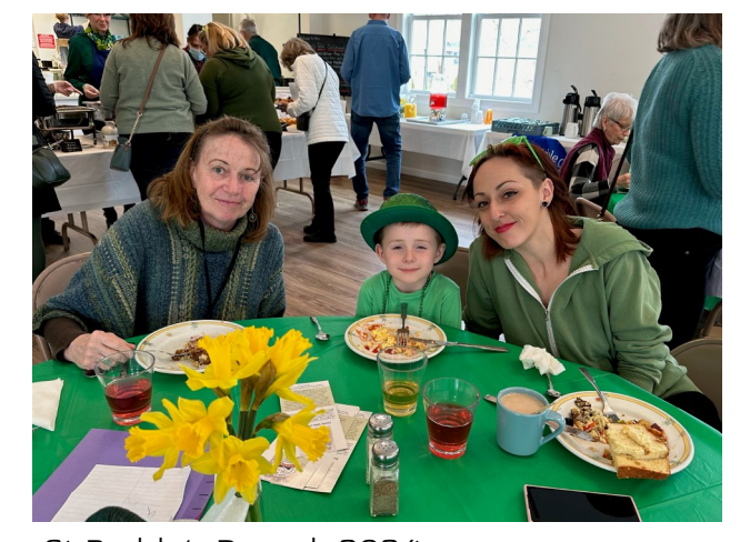
St Paddy's Brunch 2024