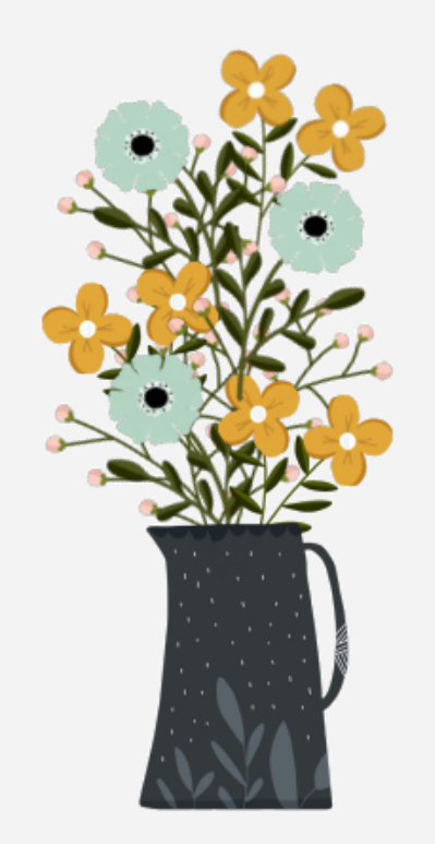
planting our vision

Our church structure includes seven primary teams: Administration, Deacons, Equipping Ministry & Growth, Pastor-Parish, Mission, Stewardship, and Worship Teams. These teams facilitate the holy work of being church — from planning vibrant, relevant worship and serving communion to ensuring that our lights stay on and the facility is well-maintained. We use our diverse God-given gifts and talents to serve the church as a whole, so that we might be the body of Christ in the world.