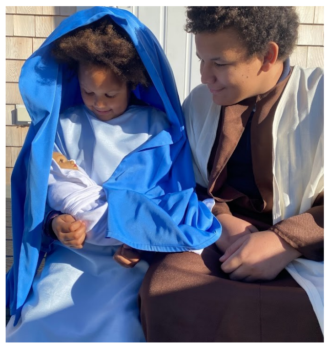
Christmas Pageant 2023