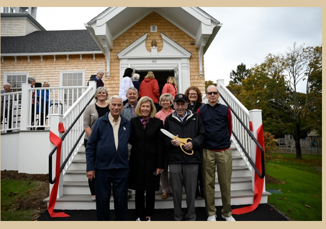
Our Building Expansion Team