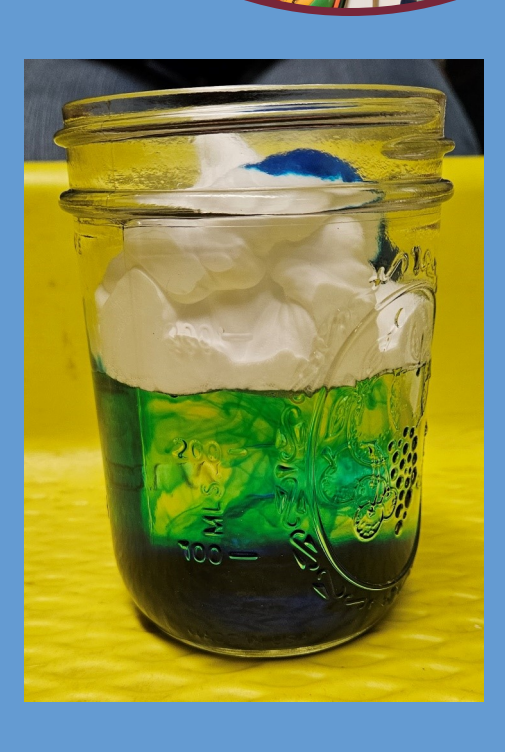
2024 Annual Report

The Cotuit Nursery School is located in the downstairs of the church. We offer a half-day program that begins at 9:00 a.m. and ends at noon. Our teachers are CORI checked and CPR/first aid certified. Our director has a Bachelor's Degree in Early Childhood Education. Our staff are all certified through the Massachusetts Department of Early Education and Care. Our school is a mission of the church, keeping tuition affordable for families. Our curriculum includes all the domains required by the Massachusetts framework, as well as additional studies that we feel make the children's preschool experience well rounded.