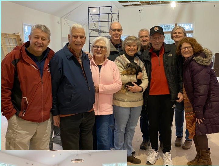
BET Team in New Hall