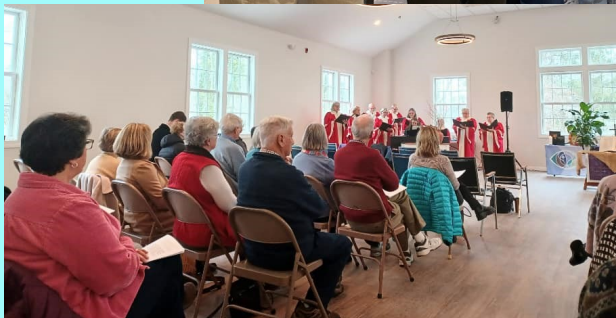
Worship in New Hall