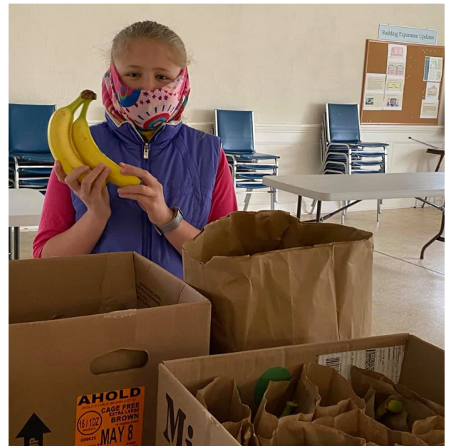
Food Packing 2020