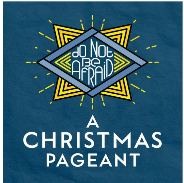
Christmas Pageant 2021