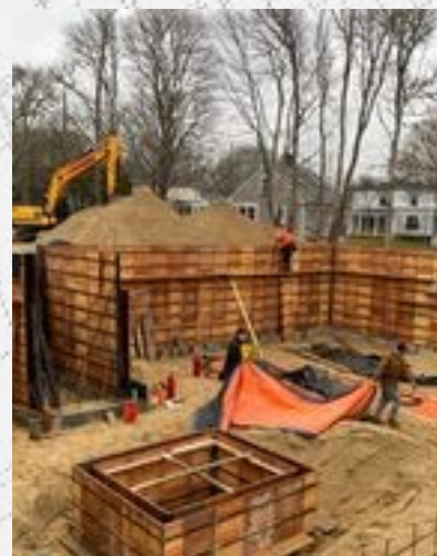
Pouring the foundation footings January 2022