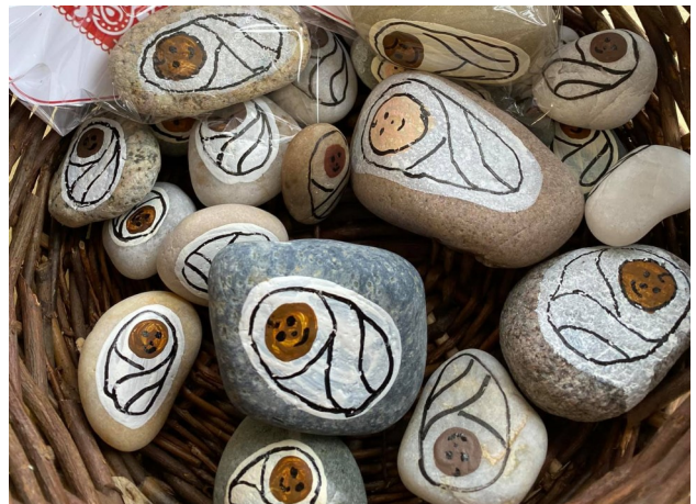
Baby Jesus Rocks 2020