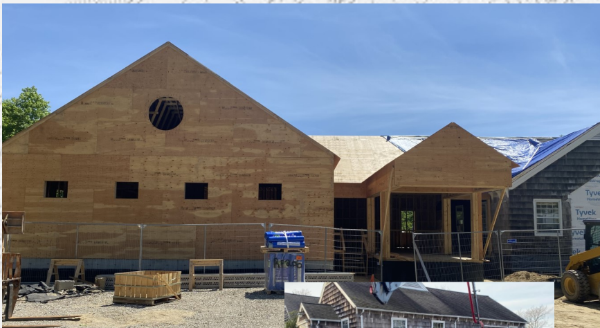
Construction Progress May 25, 2022