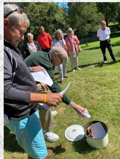
Burning of the post office mortgage September 2021