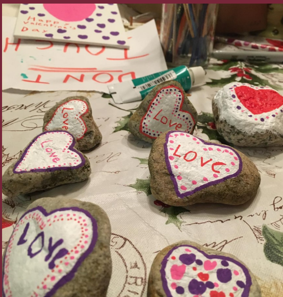
Valentine / Lent Gift Bags delivered to every member February 14, 2021