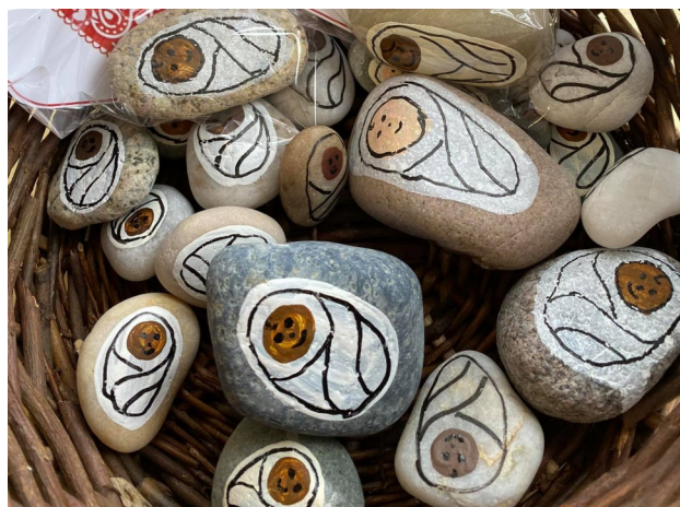
Baby Jesus Rocks 2020