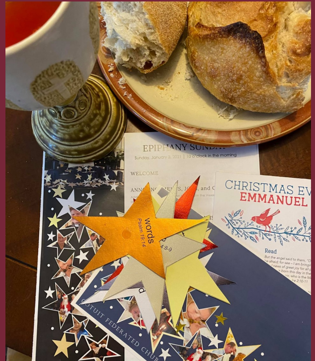
Epiphany Star Cards mailed January 3, 2021