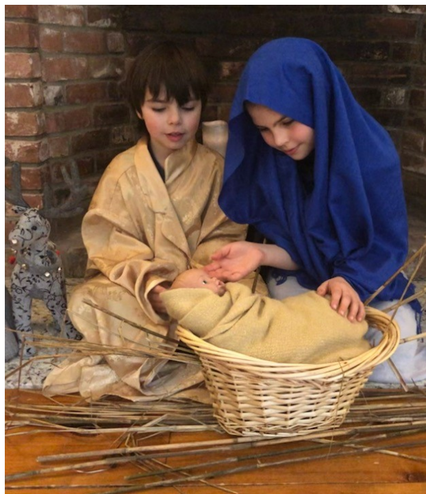
Christmas Pageant 2020