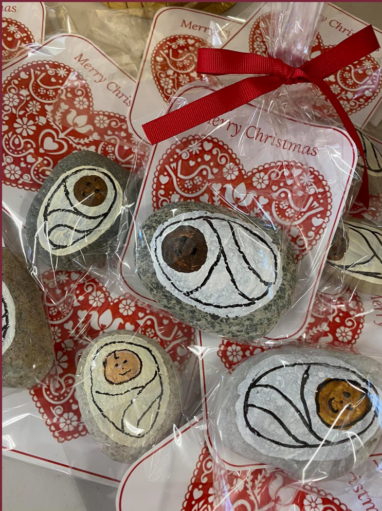
2020 – Christmas Poinsettias and 'Baby Jesus' rocks