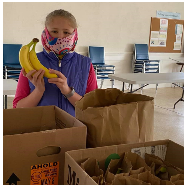
Food Packing 2020